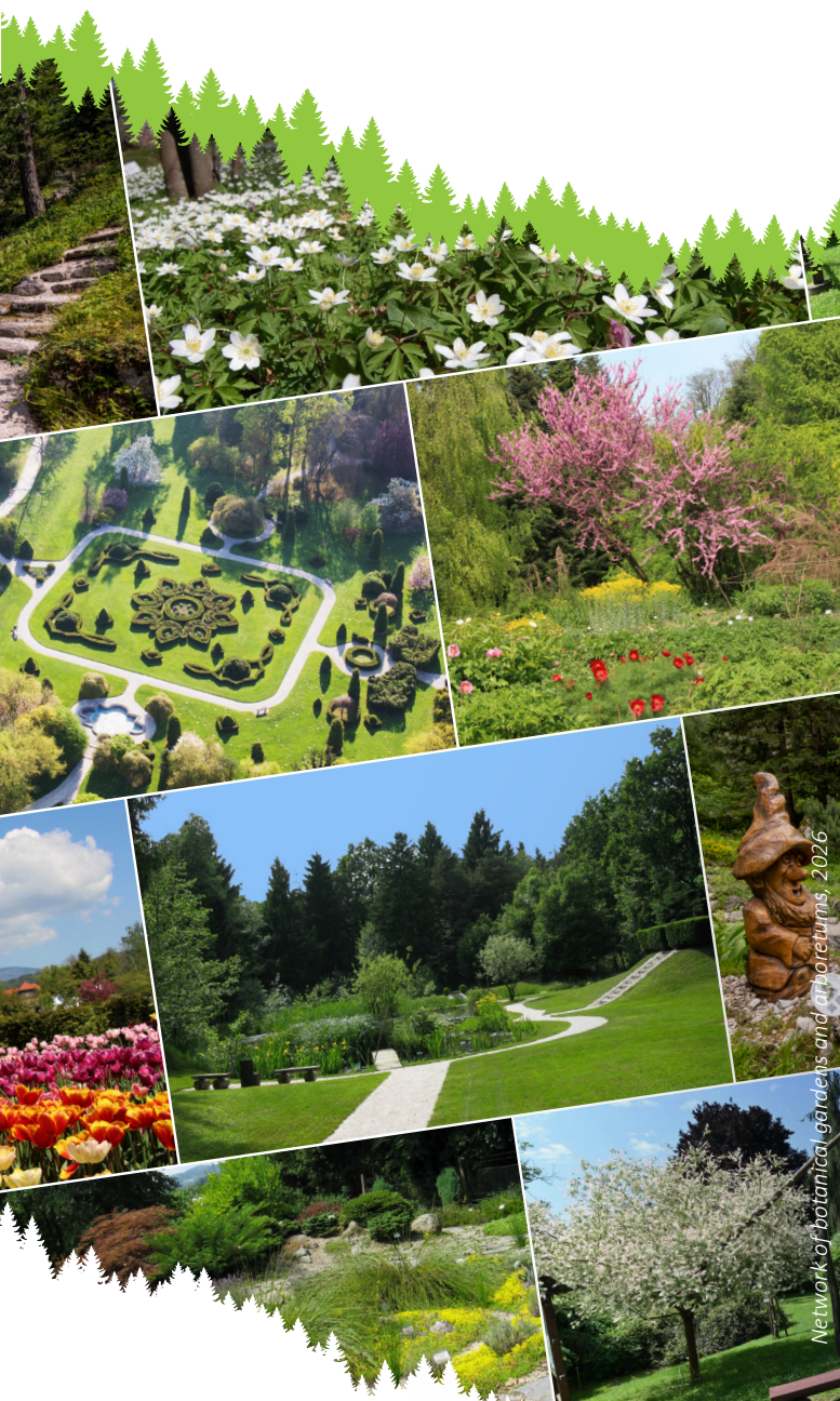
Network of botanical gardens and arboreta, 2026